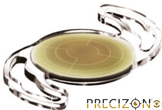
PRECIZON NVA Aspheric Presbyopic IOL