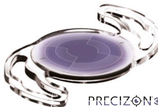
PRECIZON Aspheric Presbyopic Toric IOL