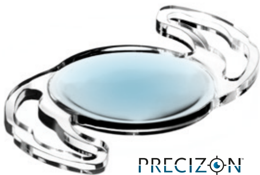
PRECIZON Aspheric Monofocal IOL