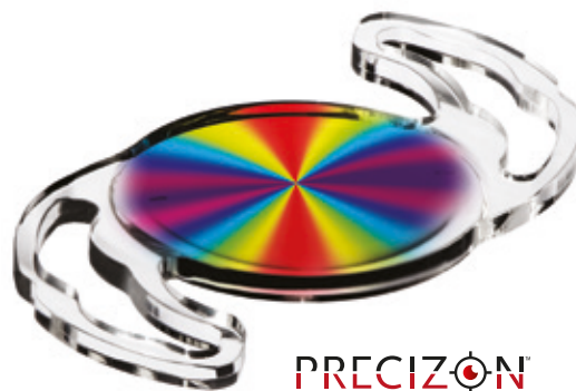
PRECIZON Aspheric Toric IOL